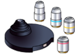
VCD01 Contrasting unit