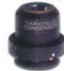
VADF01 Advanced dark field condenser