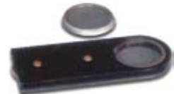
VPL01 Polarized light unit