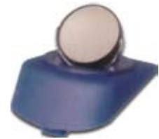
VNRM01 Natural reflecting mirror